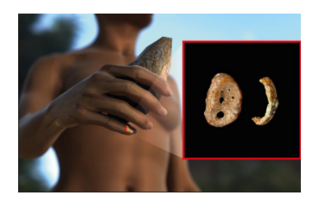
Figure 2. Distal phalynx of the hand, found in the Denisova cave.

However, archeological evidence indicated that archaic hominins also lived at higher latitudes, where the potential for DNA preservation is greater. One such region is the Altai mountains in southern Siberia where hominin occupation may have occurred more than 125,000 years ago. Bone specimens suitable for morphological classification do not exist from most sites in the Altai, but small pieces of human skeletons such as teeth and bone fragments have been recovered.