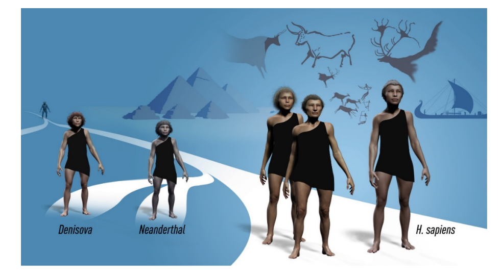
Figure 4. Archaic genomes offer exciting new possibilities to identify critical genetic features that distinguish modern humans from Neanderthals and Denisovans.

There are around 31,000 single-nucleotide positions in the genome where present-day humans from all parts of the world carry only a novel (derived) nucleotide, whereas both the Neanderthal and Denisovan genomes carry the ancestral nucleotide, conserved since the split from chimpanzee. Of the variants that are fixed in present-day humans, around 3,000 are in regulatory regions, around 30 affect putative splice sites, and around 100 affect protein-coding regions, altering amino acid composition [61]. Elucidating the functional relevance of uniquely human genetic variants is an exciting challenge of relevance to all Homo sapiens, which represents one of Svante Pääbo's main current lines of research.